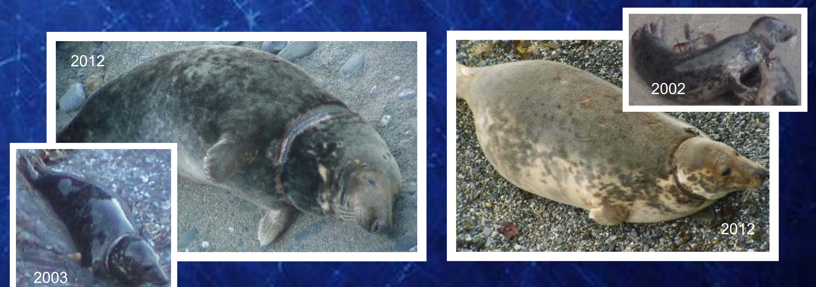
Fig 7: Two seals which have been seen for nine and ten years respectively; DP122 a male seal (left) has survived from 2003 to present, S46 a female seal (right) has been seen from 2002 to present and has pupped twice at this haul out.