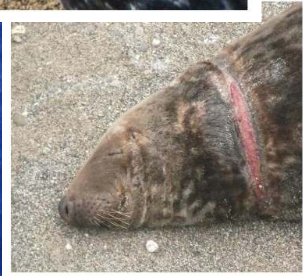
Fig 4: Injuries were categorised as: "constriction" – bottom right, "open wound" – centre, "constriction and wound" – top left, "evident" (not illustrated - entangling material or encircling mark was observed but no wound or constriction was visible)

Where visible the majority of entangling material was identified as fisheries related material (14 of 15 cases).