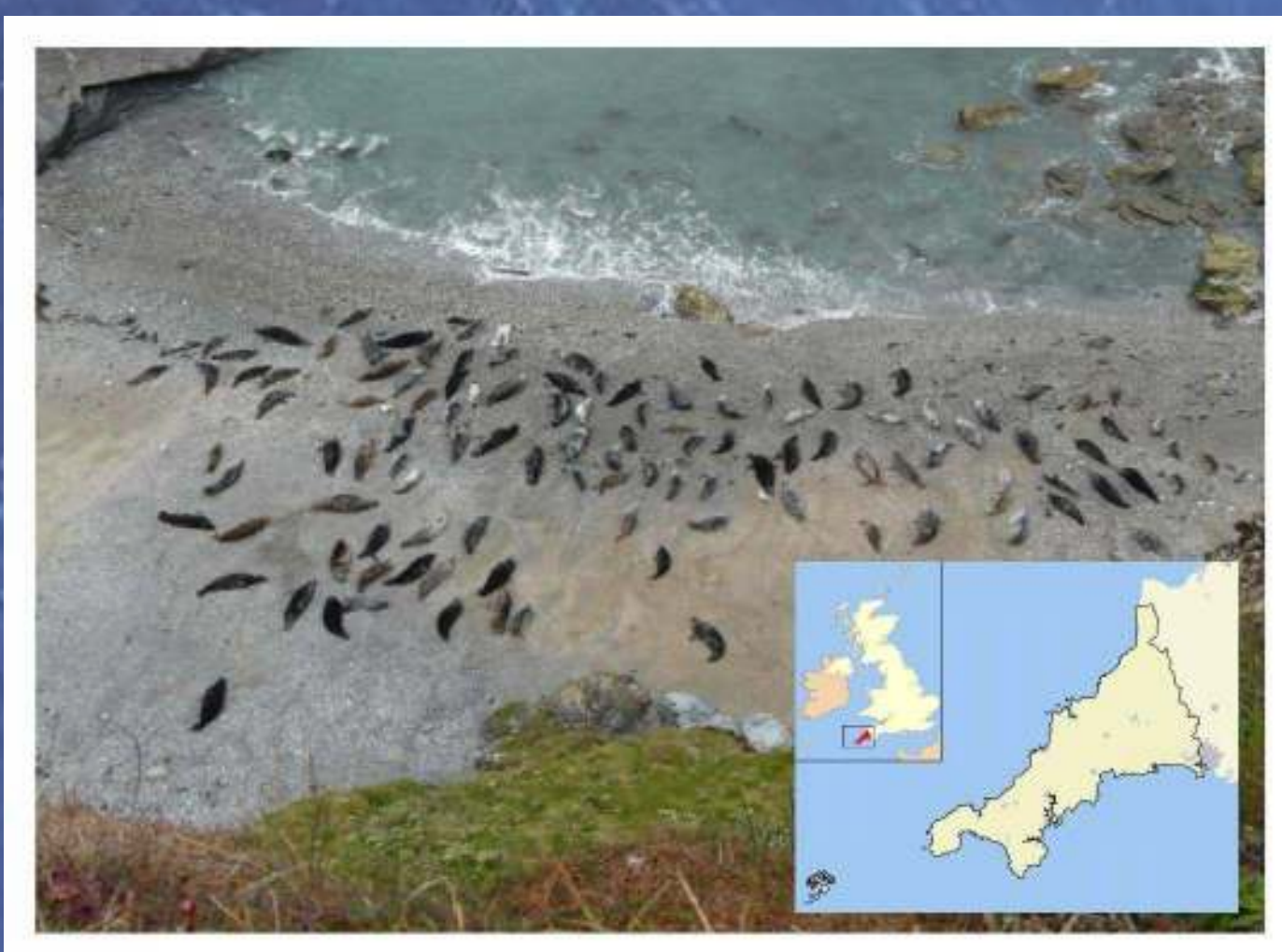
Fig 1: Haul out site in north Cornwall, UK.

A large number of the population of grey seals from southwest England are suffering from a debilitating and presumably painful condition for months or even years of their lives, the welfare implications of this need to be addressed.