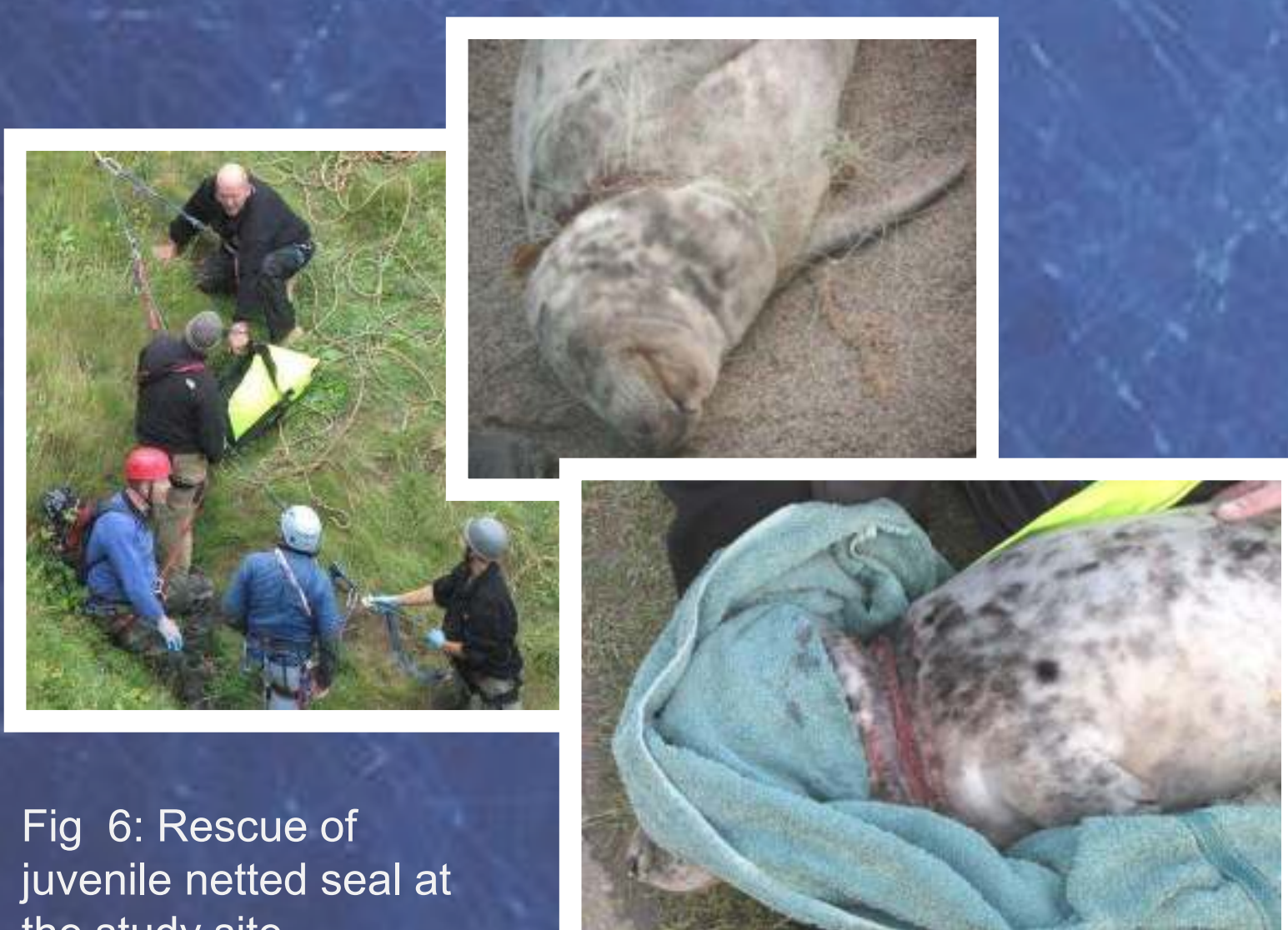
Fig 6: Rescue of juvenile netted seal at the study site

Volunteers with British Divers Marine Life Rescue have successfully rescued twenty seals, for most the severity of their injuries required treatment and these were taken to the Cornish Seal Sanctuary in Gweek for rehabilitation (figure 6).