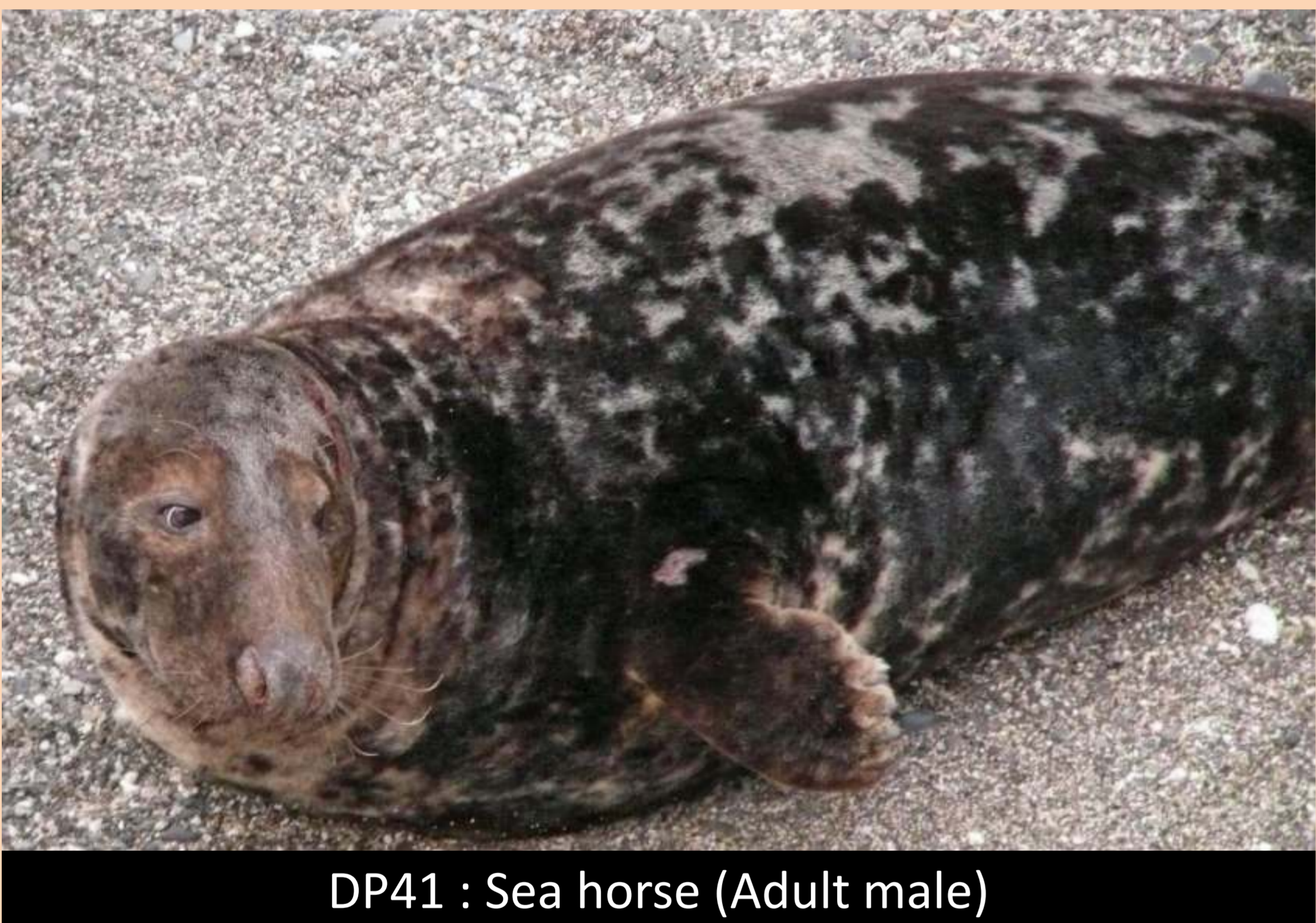
DP41 : Seahorse (Adult male)