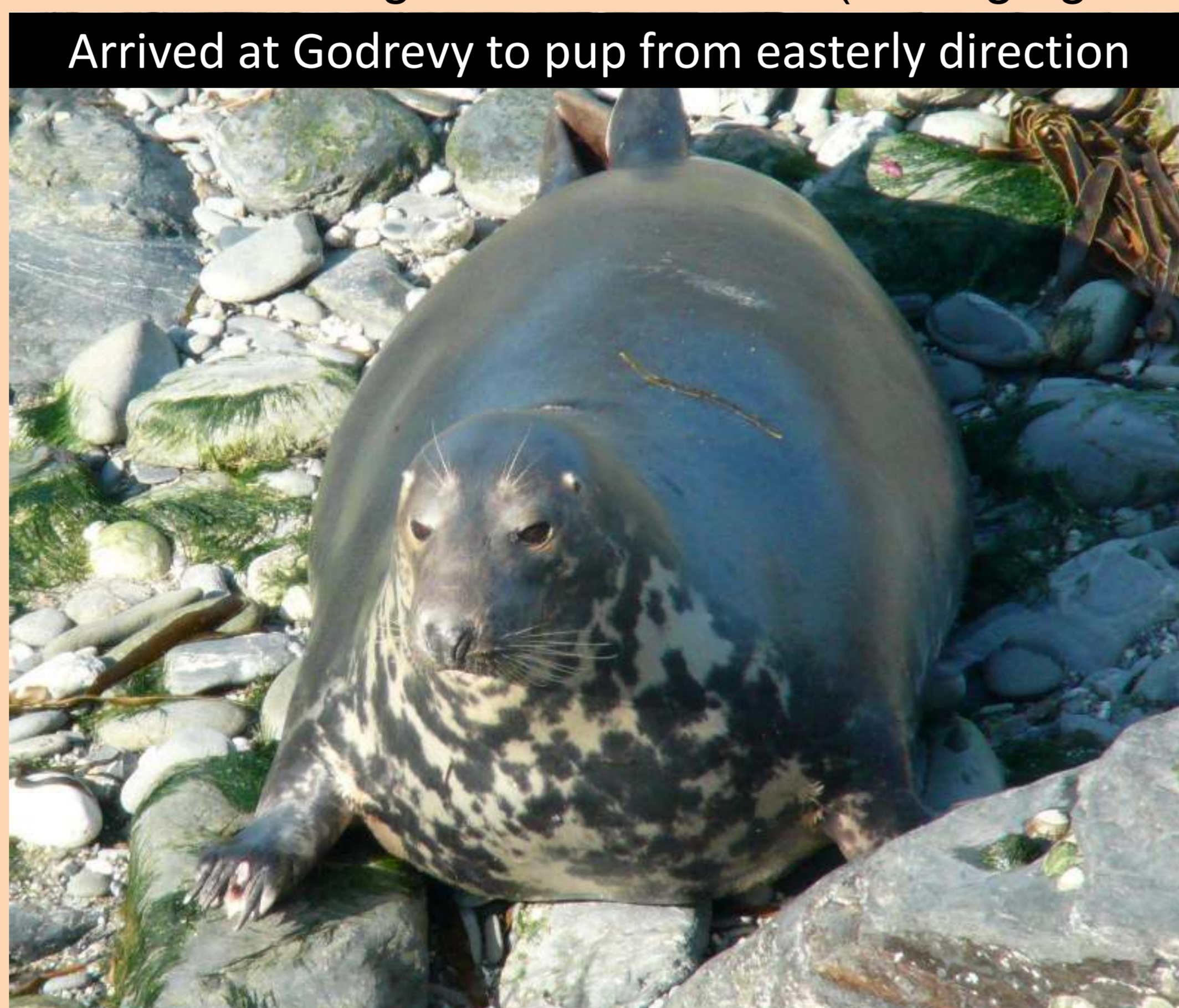
S262 : Ghost 2 (Adult female, 3 days before pupping)