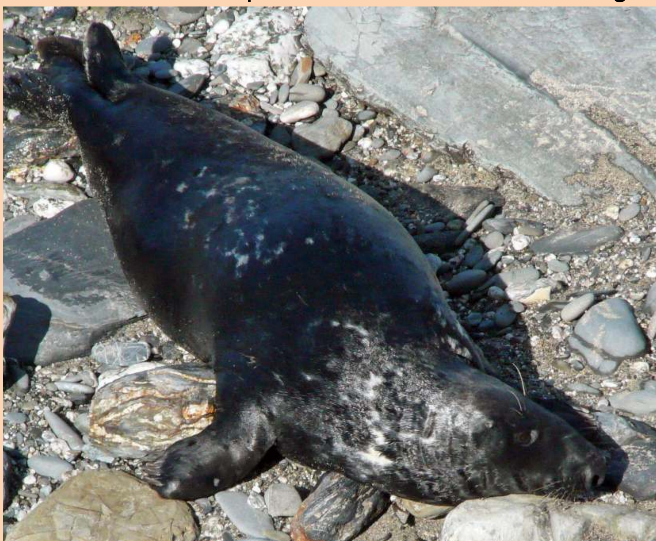
DP143 : 3 Pearls (Adult male)

Several notable movements were recorded, including DP41 'Seahorse' (male) at Godrevy on 01/09/03, Porth Joke 09/09/03 and Godrevy 13/09/03, swimming at least 50 km in 12 days; DP143 '3 Pearls' (male) at Godrevy on 15/03/08, Scillies 25/03/08 and Godrevy 27/03/08, swimming at least 140 km in 12 days and S262 'Ghost 2' at Morte Point on 08/09/08, Godrevy 20/09/08 - pupping on 23/09/08, having swum at least 89 km in 12 days. Whilst seals are known to swim considerable distances, our understanding of the connections seals make between these sites is important and informative to conservationists. As research continues and expands to other sites, a much greater understanding of individual seal (and age/gender group) seasonal movement patterns can be learned.