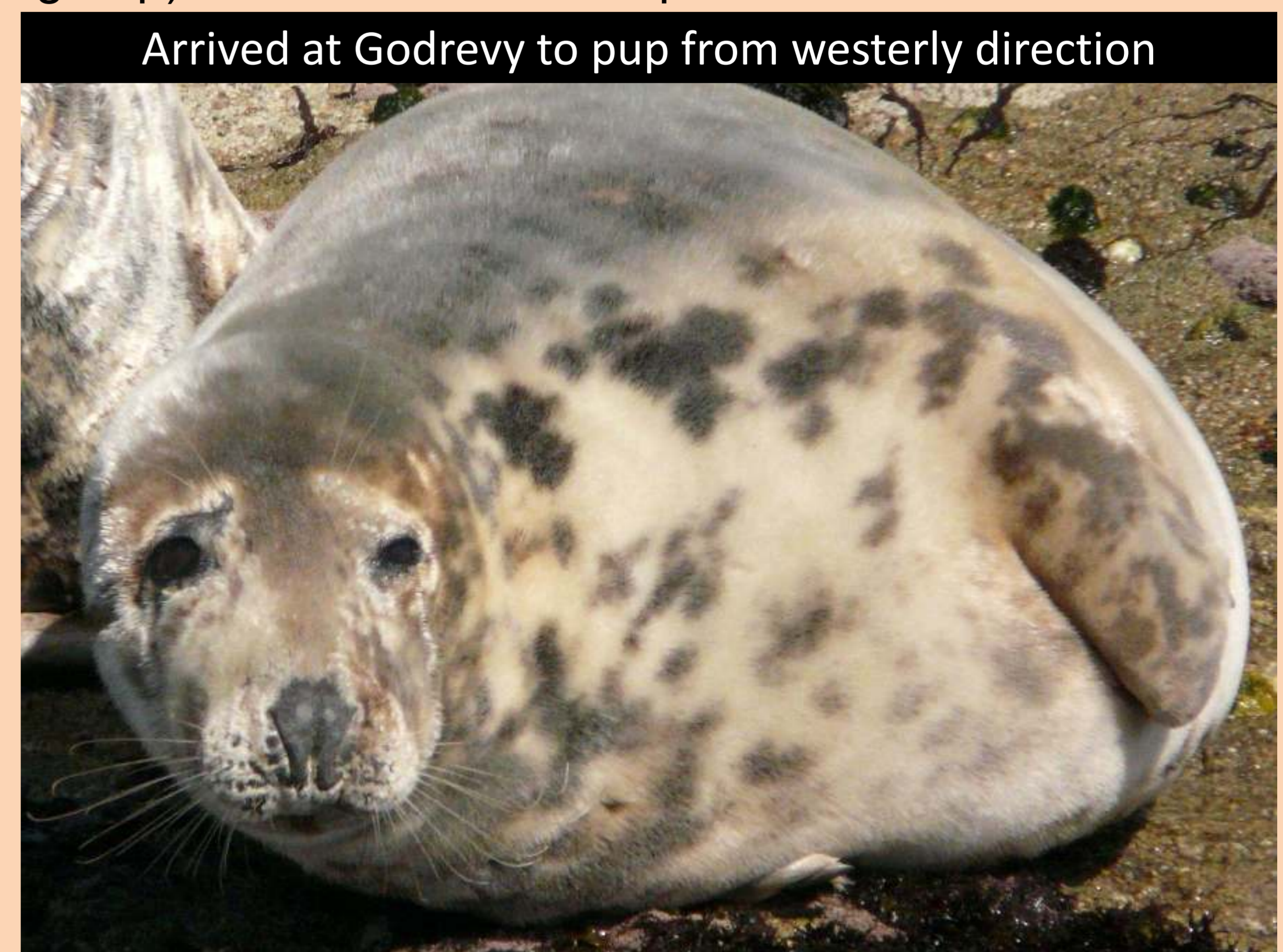
S163 : Wriggle (Adult female, 32 days before pupping)

Future seals surveys will develop our understanding of seal links across the Celtic Fringe.